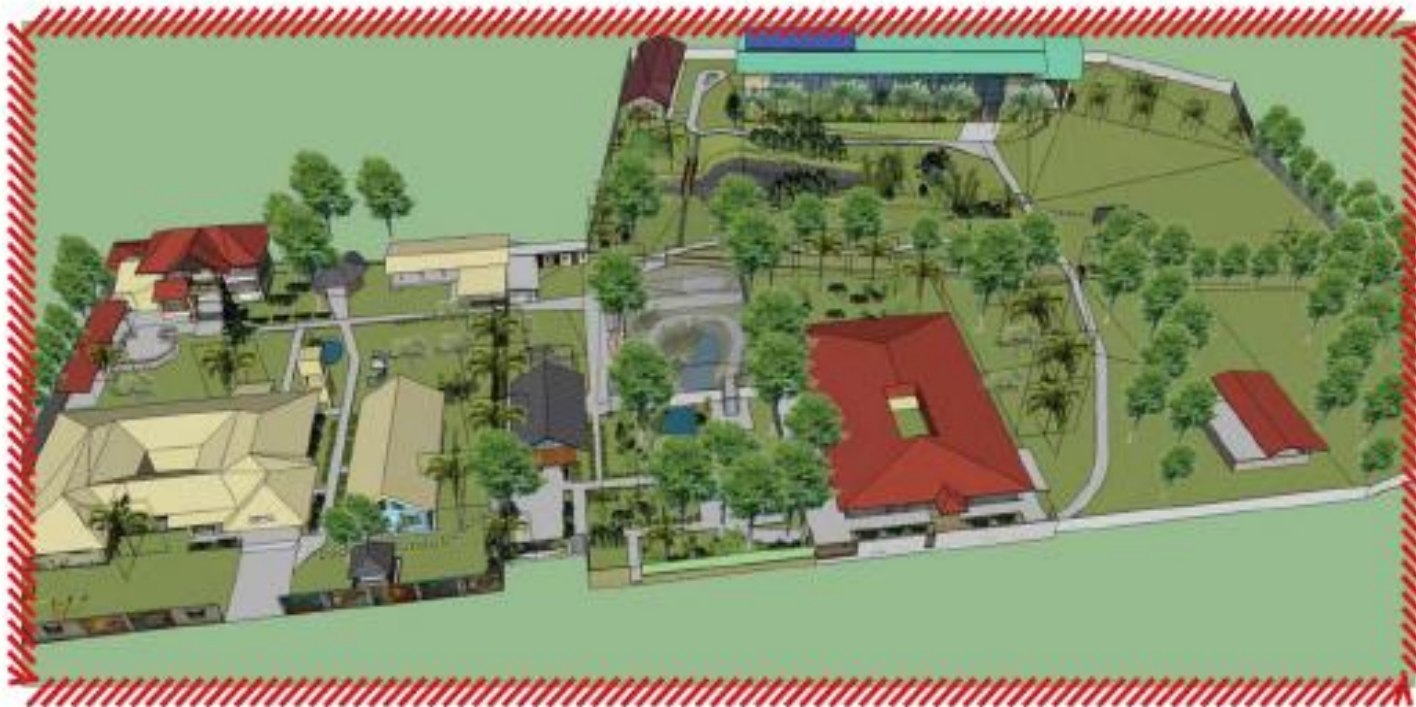
Cameleon Association in Passi City

Cameleon stands and acts a model institution that promotes the empowerment and development of children and their families through education, advocacy and other psychosocial interventions.